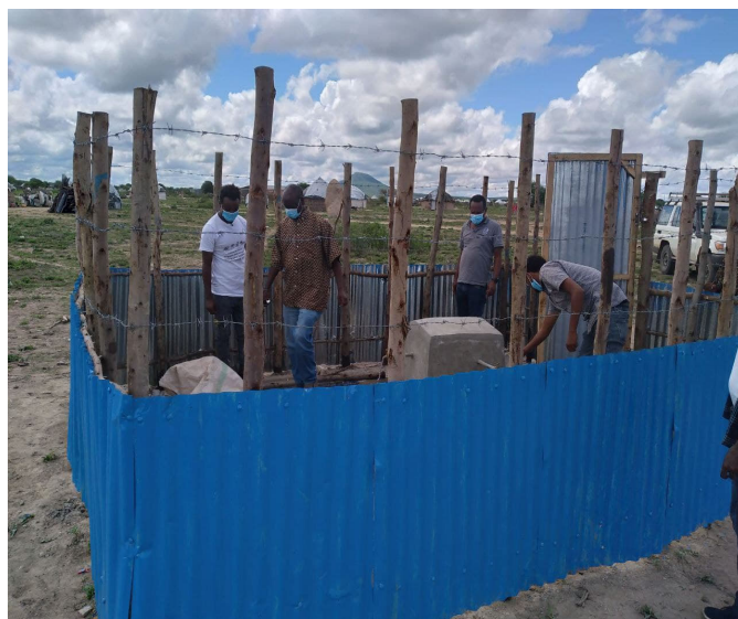
Pipe line expansion with water point at Guchi