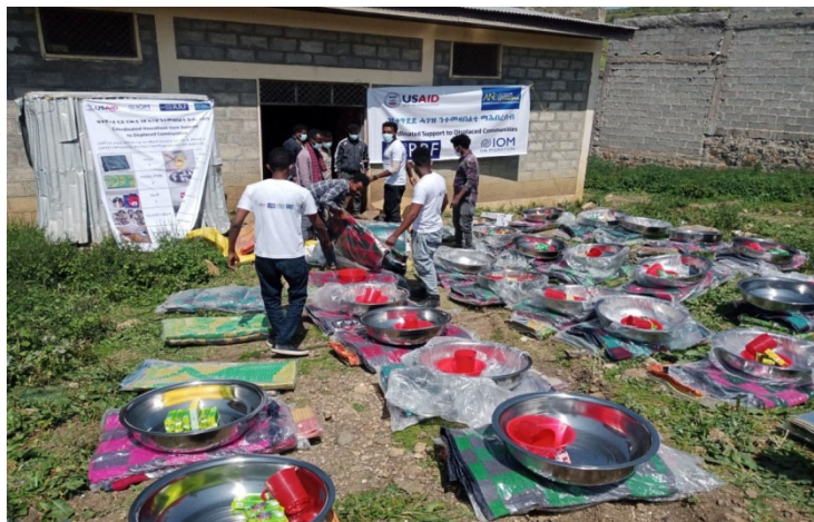
Figure-6: During distribution of NFI kits