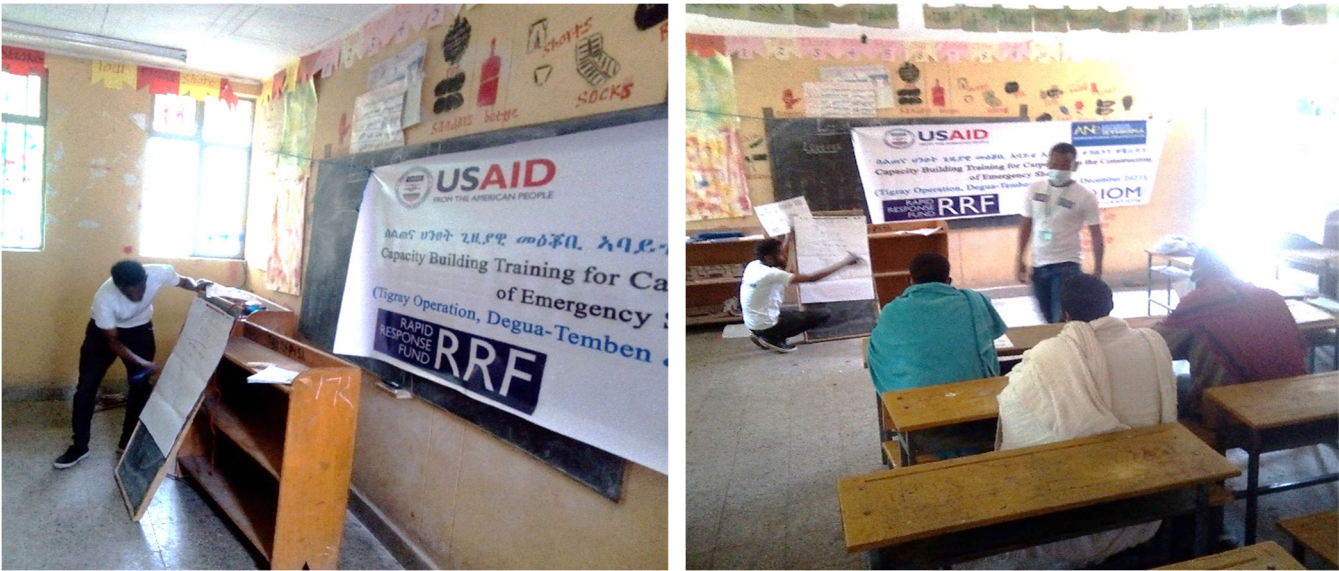
Figure-2: During training for carpenters