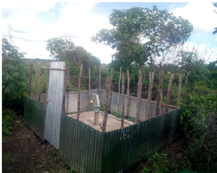
A shallow well at Ulaga Dimtu kebele, Guchi Woreda Megala