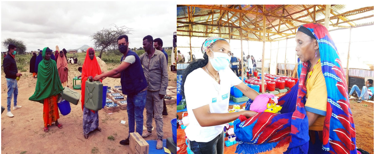
During WASH NFI, HHWT chemical and Dignity kit distributions