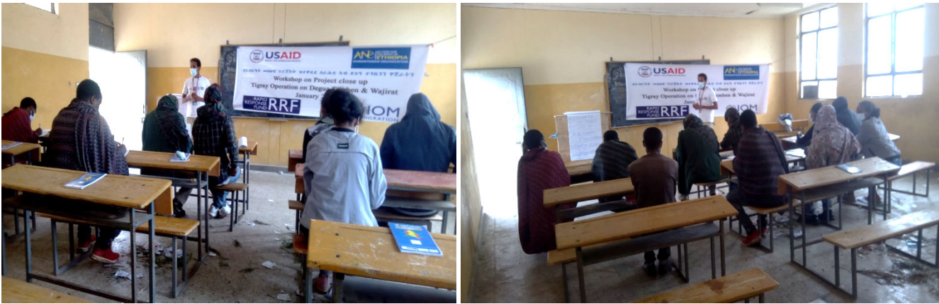
Figure-8: During project close up workshop