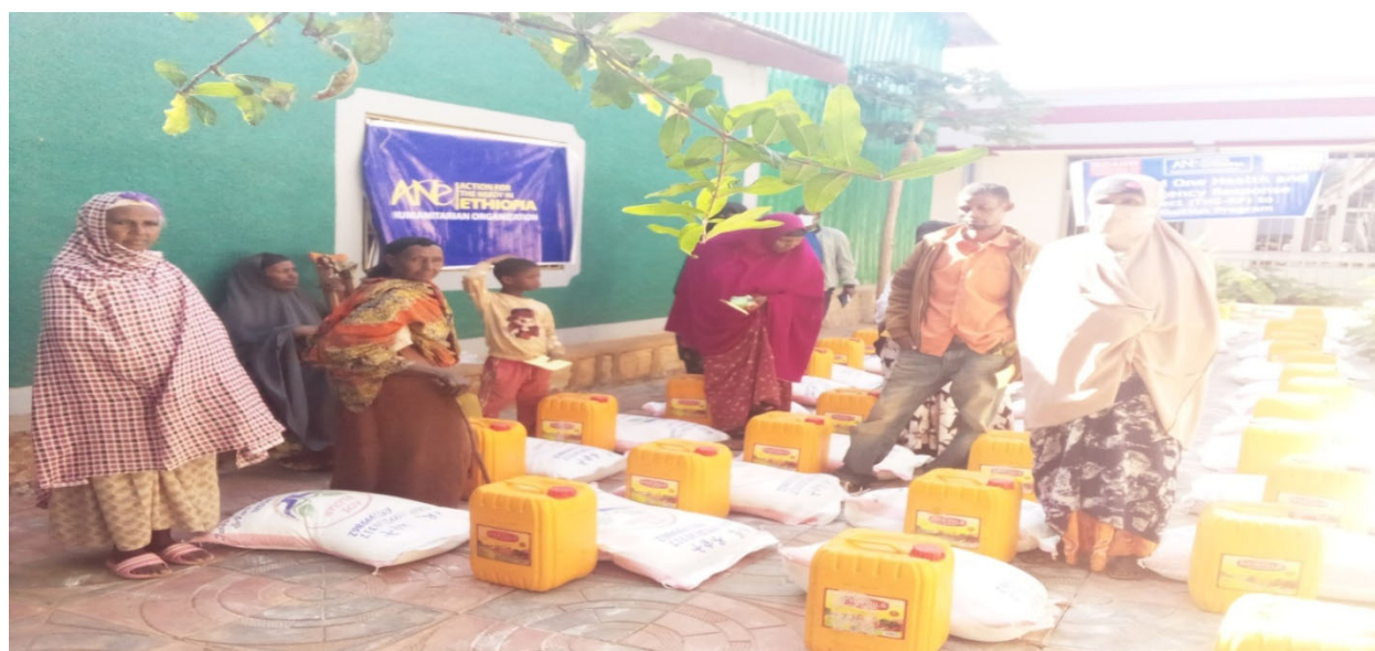
Fig. During Food distribution in Negelle town