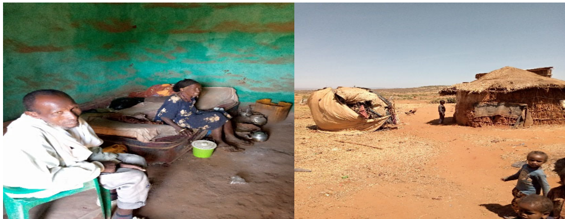
Fig. Elders with no supporter and Beneficiaries village around Medo