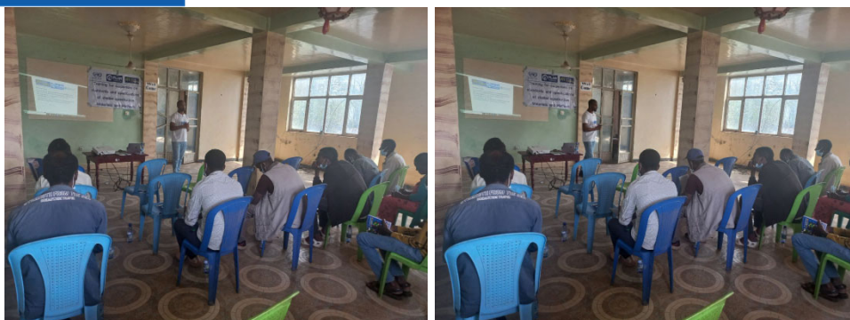
Fig. Carpentry Training