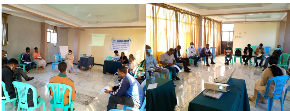
Fig. Consultation Meeting

Consultation Meeting in Presence of Government Stakeholders host community leaders and Partners MCMDO and Plan International was conducted on the project implementation and its Challenges, issues on housing, land and property operations were discussed.