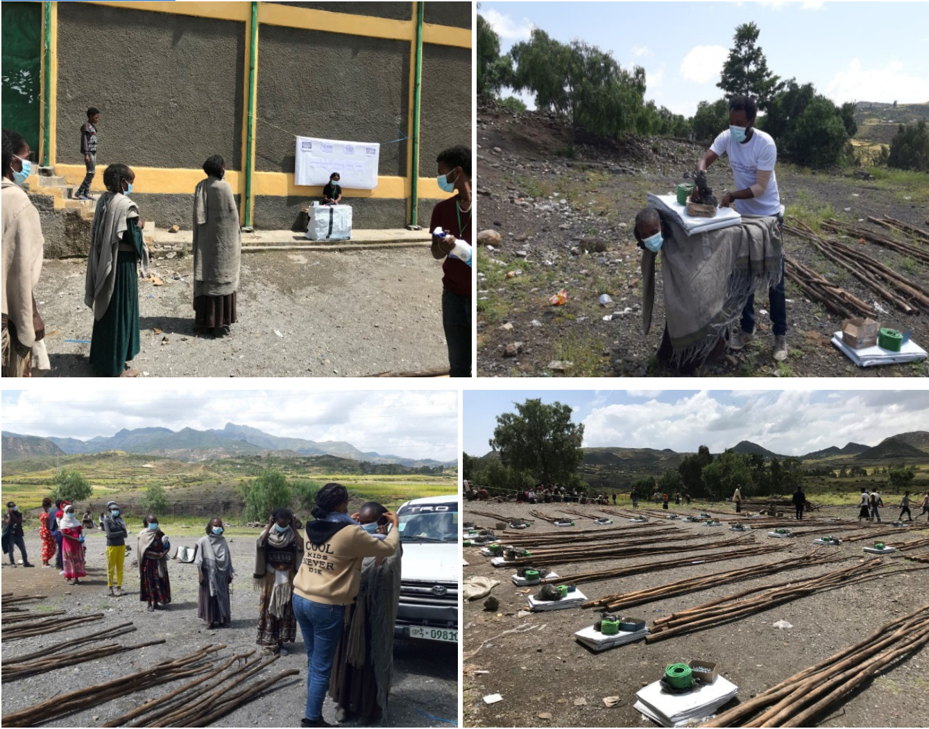
Figure-4: During distribution of emergency shelter kits