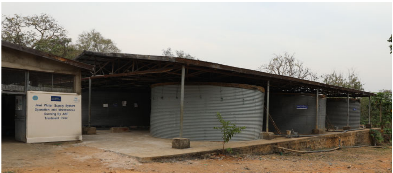
Jewi water supply system