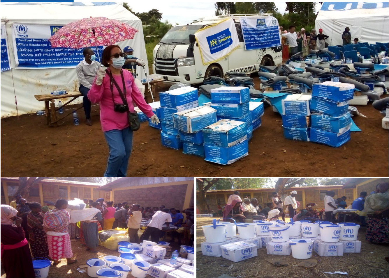
Figure – ANE-UNHCR ESNFI Distribution Programs in Metekel and Assosa Zone Administrations – 2021