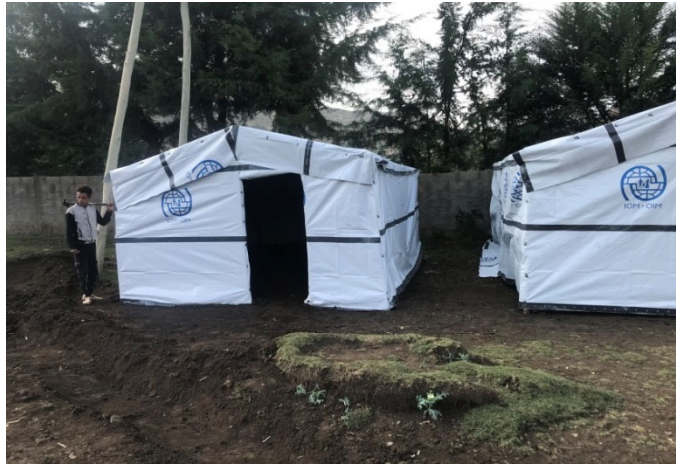
Figure-3: During construction of Demo Shelters