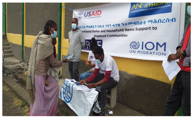
Figure-5: During distribution of plastic sheet and cash

ANE has managed receiving and transportation of non-food item (NFI) kits for 900 IDP HHs from IOM/RRF Mekele and stocked to rented warehouses at both target woredas and distributed for the targeted beneficiaries.