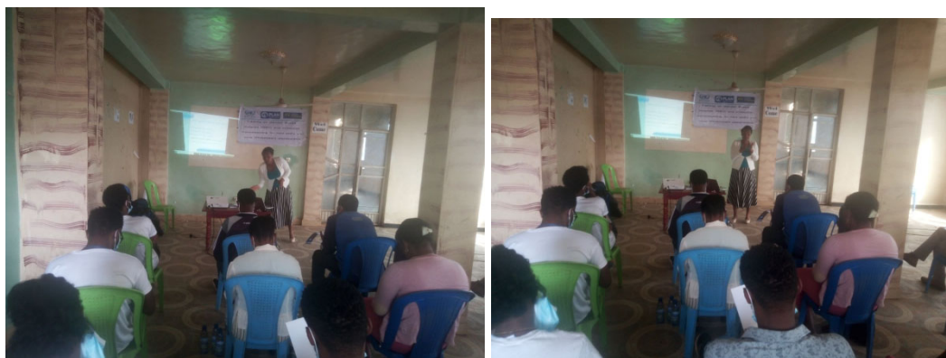
Fig. GBV Training

ANE in Collaboration with Wombera Woreda women, children and youth Office Provided GBV Training for 16 Participant composed for field staffs and local government stakeholders.