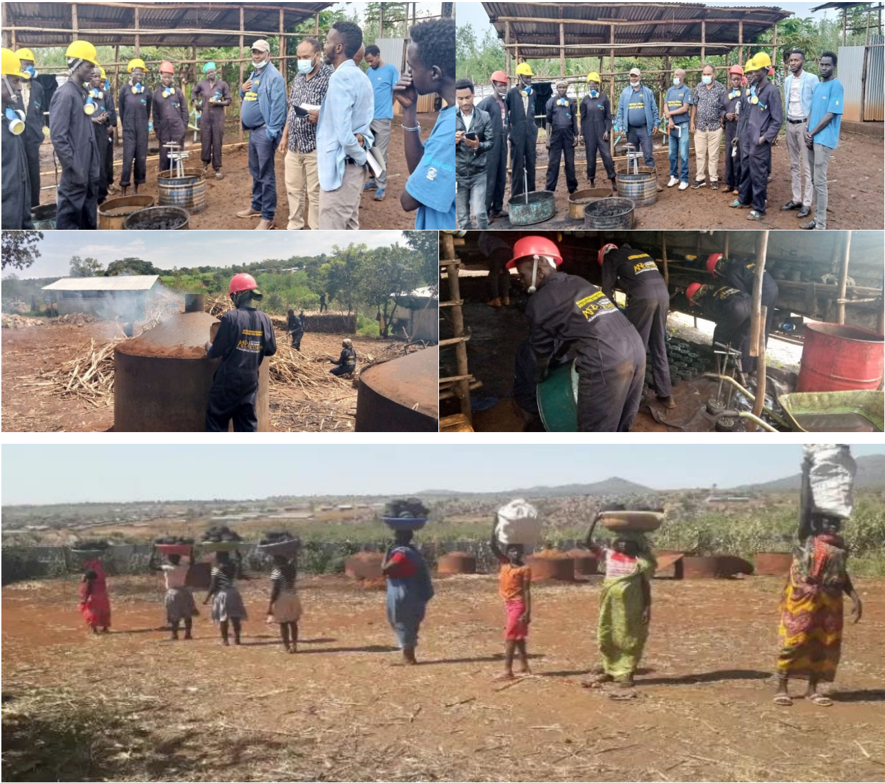
Figure- Charcoal Briquette Production and Distribution at Assosa Refugee Operation

monthly distributions of charcoal briquettes, solar lanterns, cooking stoves, legally procured firewood and other source of energy solutions for refugees from Eritrea, Sudan, South Sudan and the great lake regions.