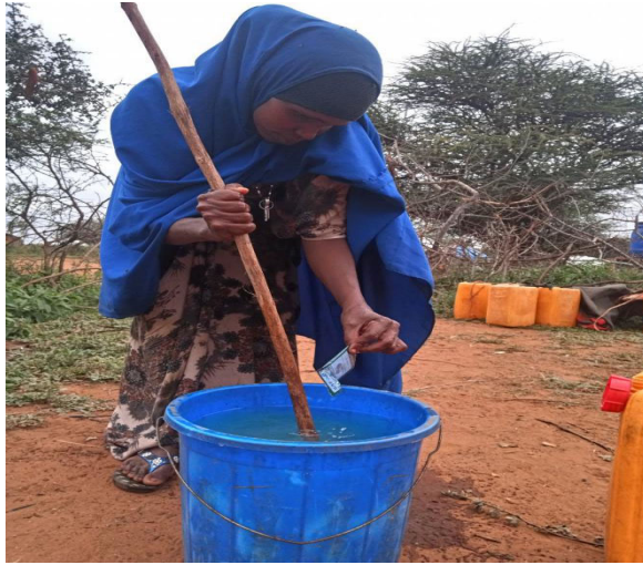
Beneficiary while using HHWT chemical